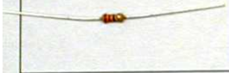
R1 330Ω Orange-Orange-Brown (1)