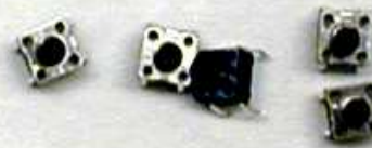
SW1, SW2, SW3, SW4, SW5 Switches (5)